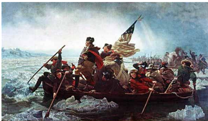
George Washington's Christmas Eve Crossing of the Delaware River

America's military has always been willing to sacrifice for the common good, even during the holidays. The Law Firm of Stephen M. Reck salutes the men and women of our armed forces helping to keep America safe and free. Thank you.