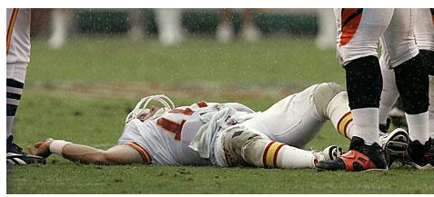
Former Chiefs QB Trent Green lies motionless after a tackle in 2006 that left him with a concussion. He missed eight weeks.

Sources with knowledge of the plan said the NFL "will soon require teams to receive advice from independent neurologists while treating players with brain injuries." Read more .