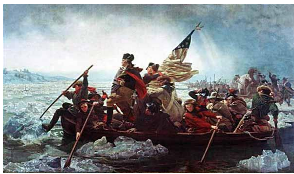
George Washington's Christmas Eve Crossing of the Delaware River